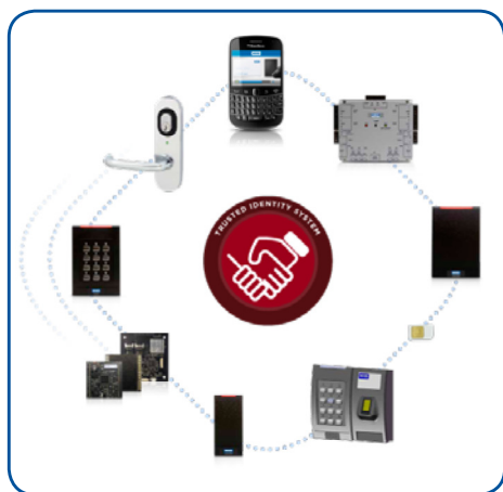
iCLASS SE® Platform